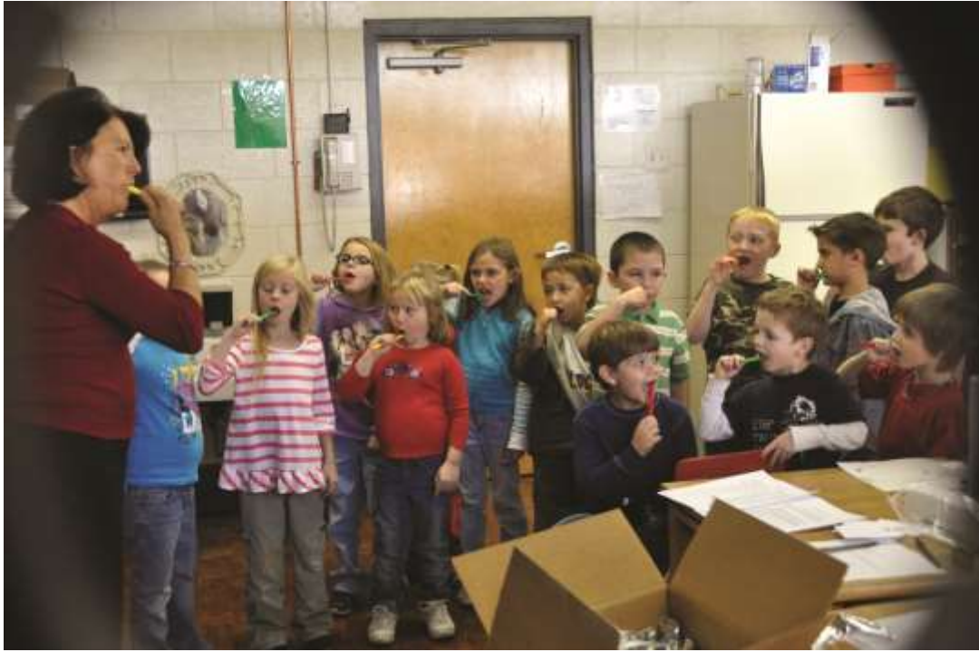
(Fig. 1-B) Volunteer instructing the students on the tooth brushing technique.