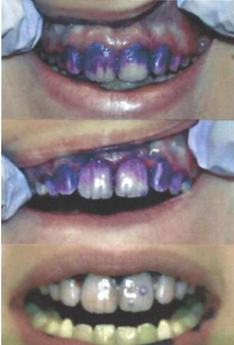
(Fig. 3) Top photo baseline (before lunch, no brushing program), middle photo, 15 days after the initial brushing and also taken before lunch. The last image was taken after 30 days and after lunch tooth brushing. A clear reduction of the plaque levels can be seen after the lunch meal tooth brushing using the pre-pasted toothbrush with the xylitol-containing toothpaste.