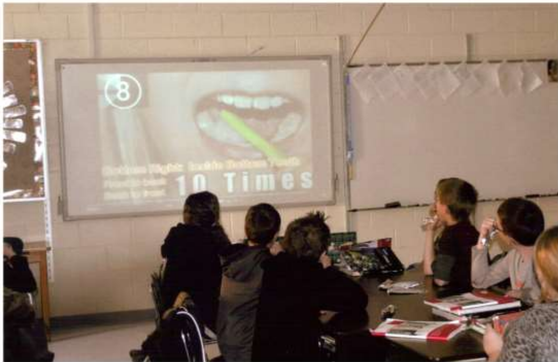
(Fig. 2) Classroom PowerPoint presentation.